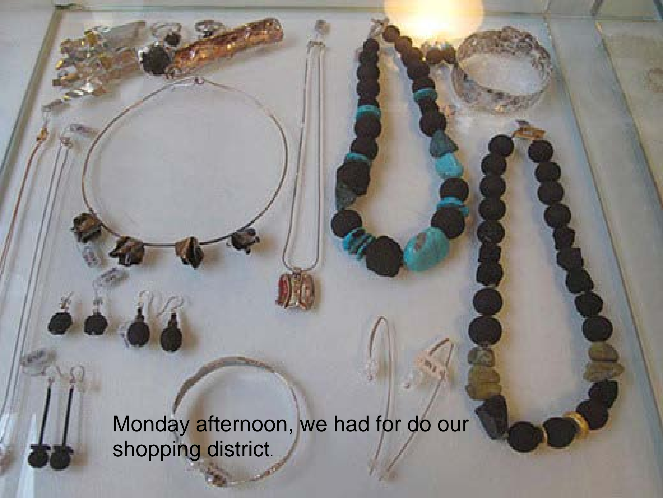
Monday afternoon, we had for do our shopping district.